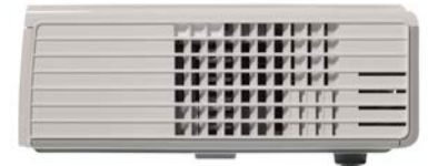
Right Side Profile